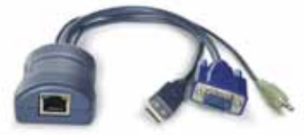
Example CAM: CATX-USB-A

1000 or standalone Ethernet operation: PSU-8MASTER